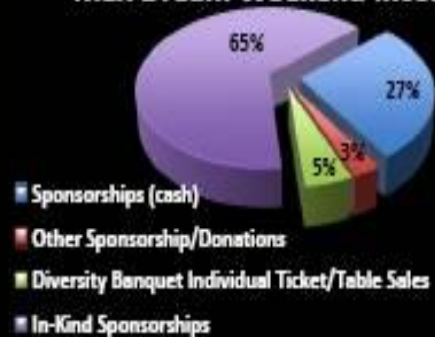
MLK Dream Weekend Income